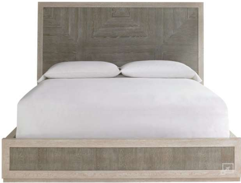
B HEADBOARD & FRAME