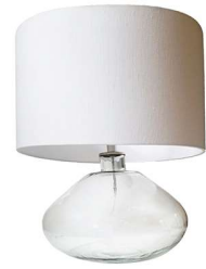
A TABLE LAMP