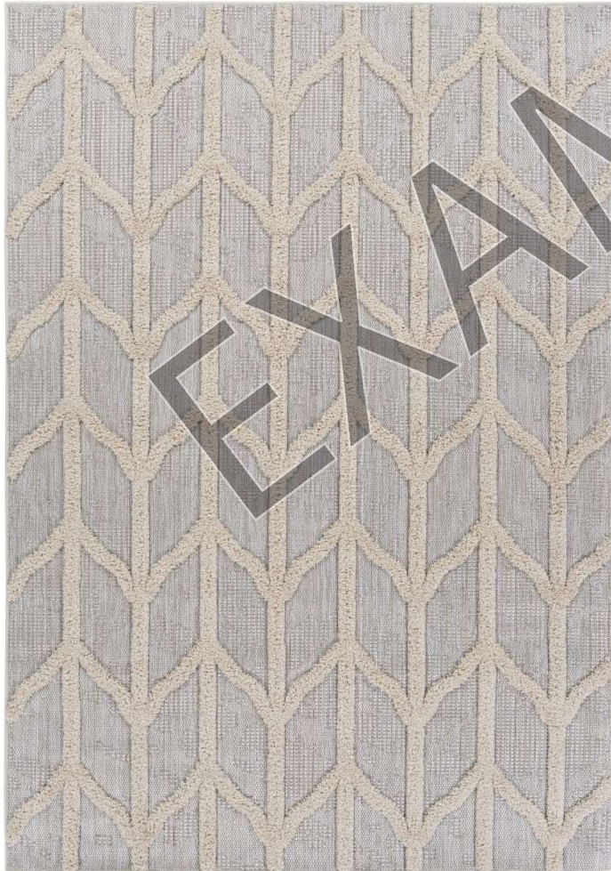
D 9X12 RUG