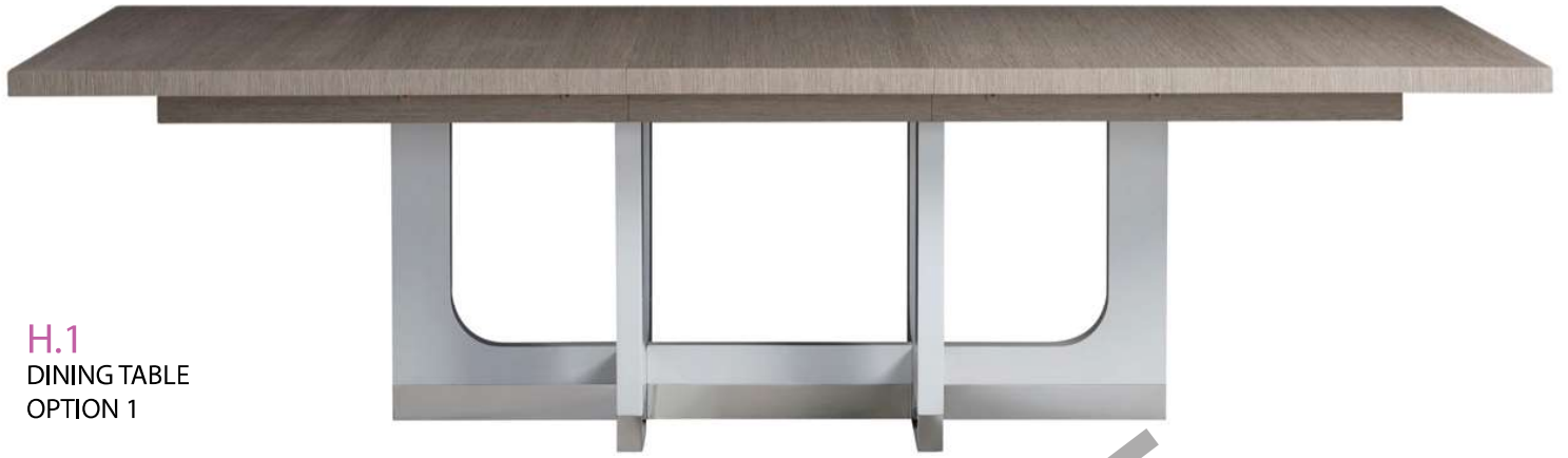
H.1 DINING TABLE OPTION 1