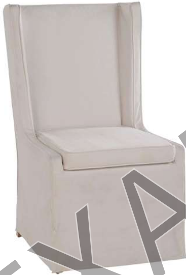
G.1 DINING CHAIR OPTION 1