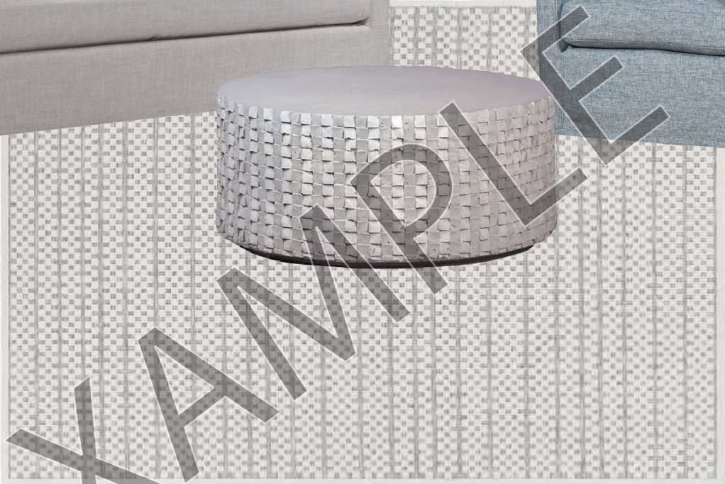
K 9X12 RUG