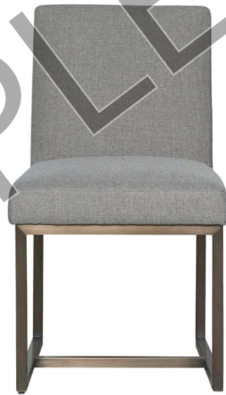
G.2 DINING CHAIR OPTION 2