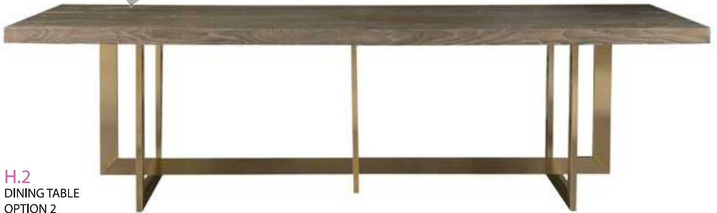
H.2 DINING TABLE OPTION 2