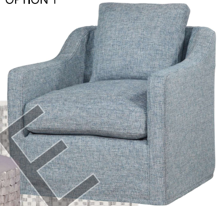
L LOUNGE CHAIR OPTION 1