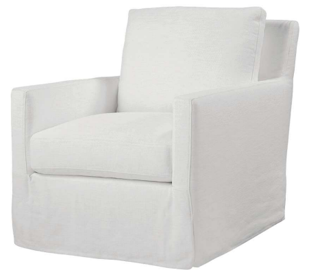
M LOUNGE CHAIR OPTION 2